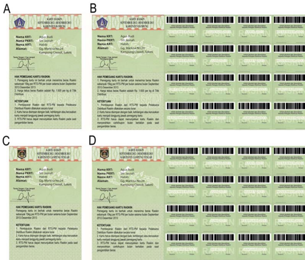
Figure 2: Raskin Cards

Note: Figure 2A shows Raskin cards with the printed price and no coupons. Figure 2B shows Raskin cards with the printed price and the coupons. Figure 2C and 2D show the Raskin cards without the price printed, without and with the coupons respectively.